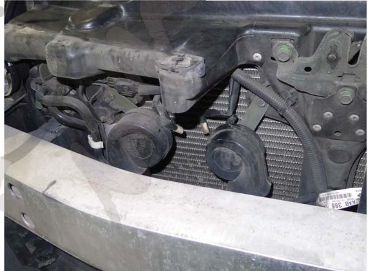
8. Stock horn location