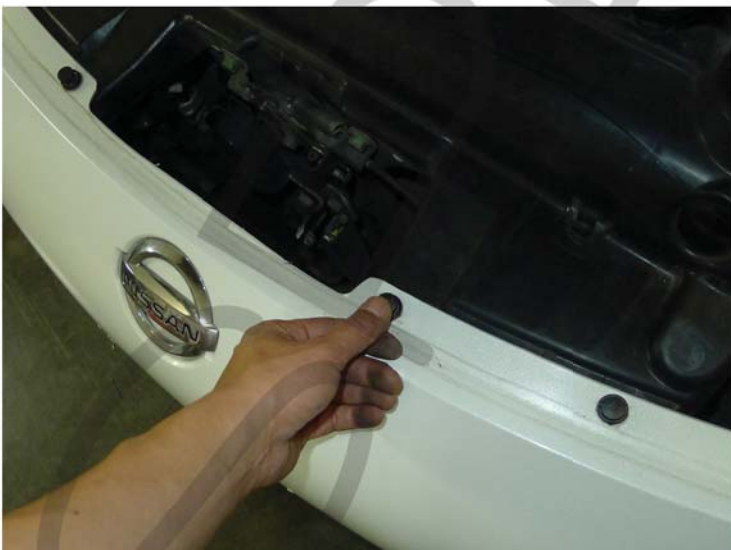
21. Replace the (6) plastic clips