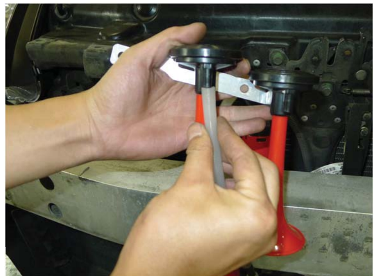
16. Install the air hose to the air horns