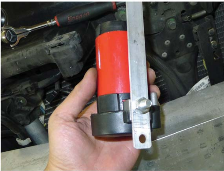
11. Attach the bracket to the air compressor