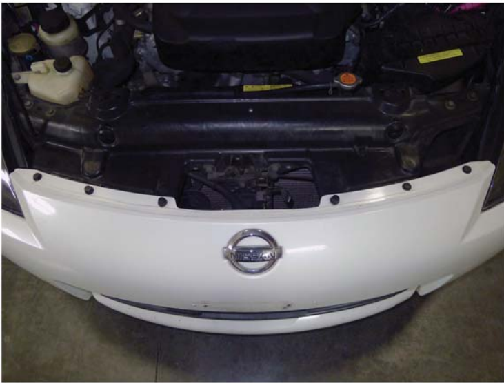
5. (6) plastic clip locations