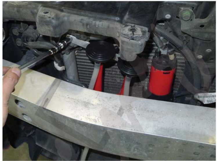
18. Attach the air horns to the car