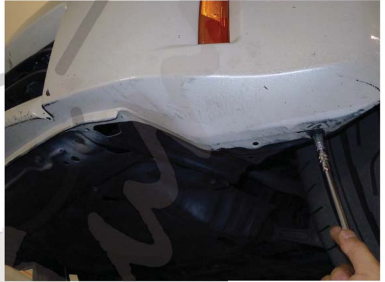
2. Remove the (8) 8mm bolts