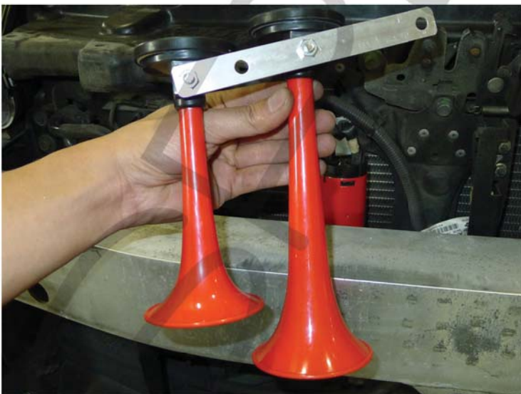
15. Attach the air horns to the bracket