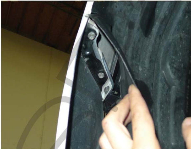
3. Pull aside the fender liner