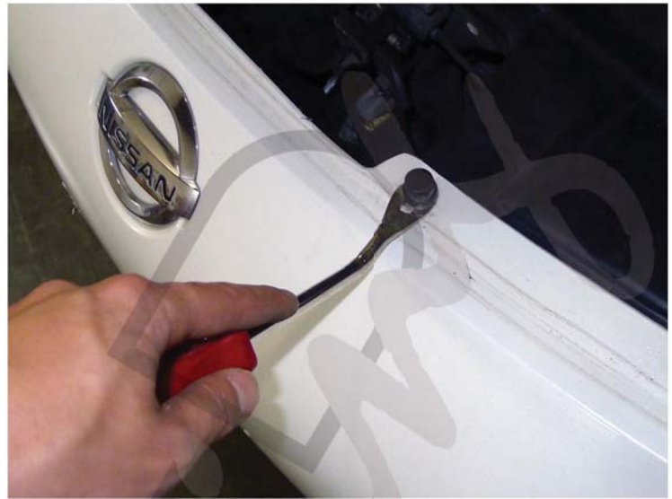
6. Remove the (6) plastic clips