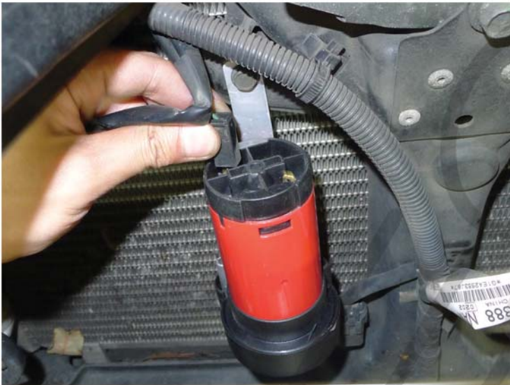
13. Connect the power to the air compressor