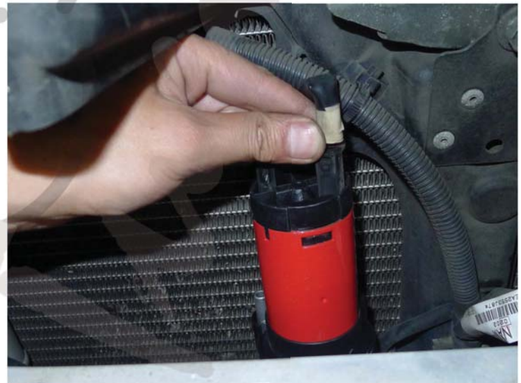
14. Connect the power to the air compressor