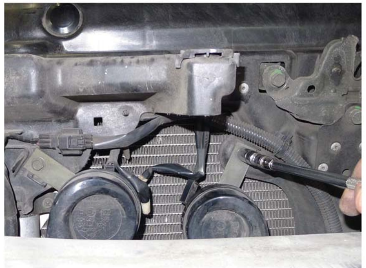
10. Remove the stock horns