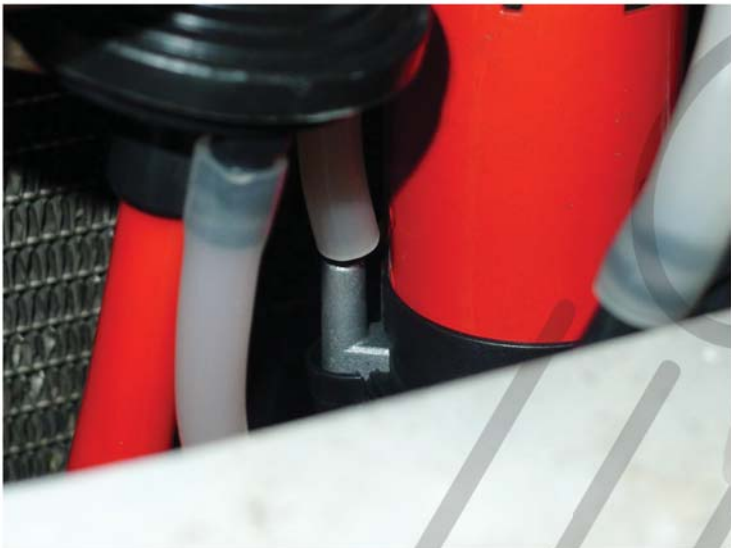
19. Connect the air hose to the air compressor