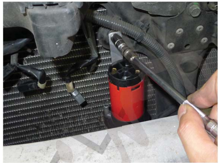
12. Mount the air compressor onto the car