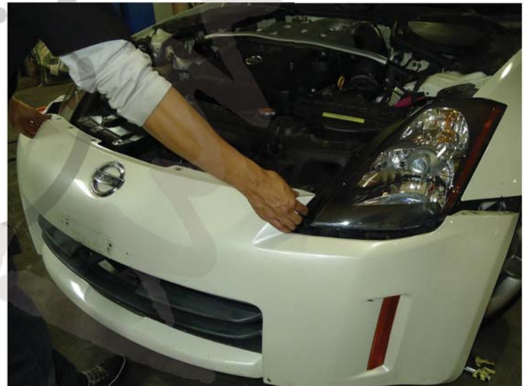
20. Replace the front bumper