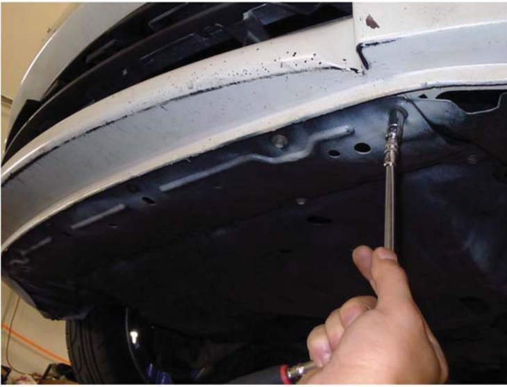
23. Tighten the (8) 10mm bolts. The installation is now complete