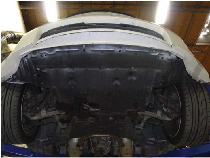
1. (8) 10mm bolt locations

Do not make direct contact with the halogen bulbs or the wire assembly until the unit has cooled down after use.