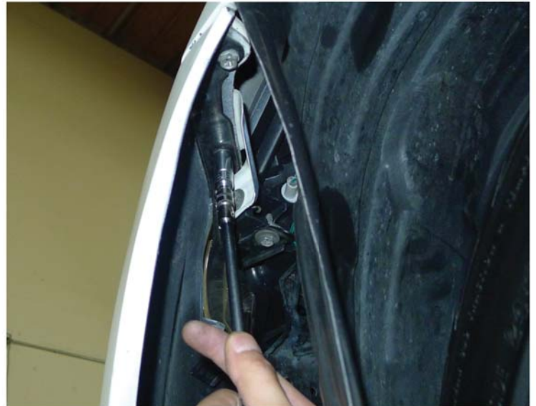
4. Remove the (2) 10mm bolts