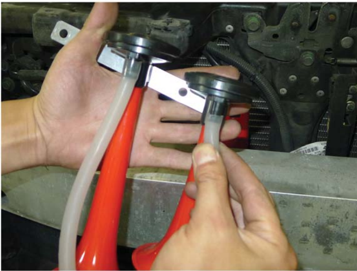
17. Install the air hose to the air horns