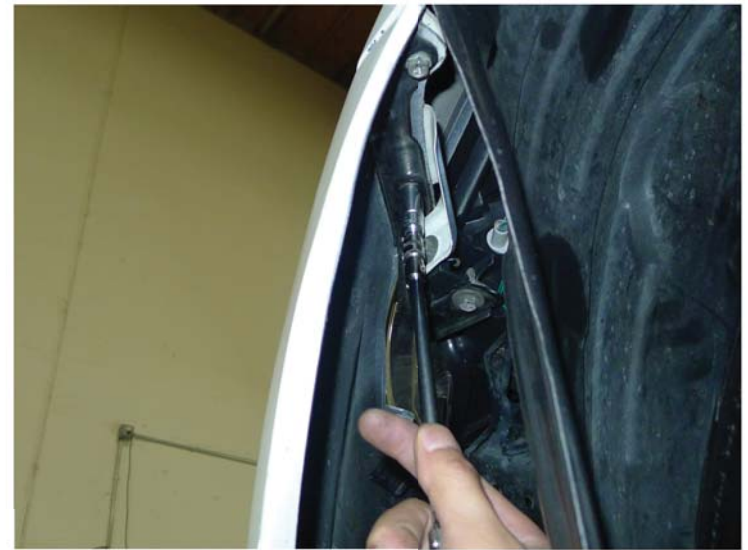
22. Tighten the (2) 10mm bolts