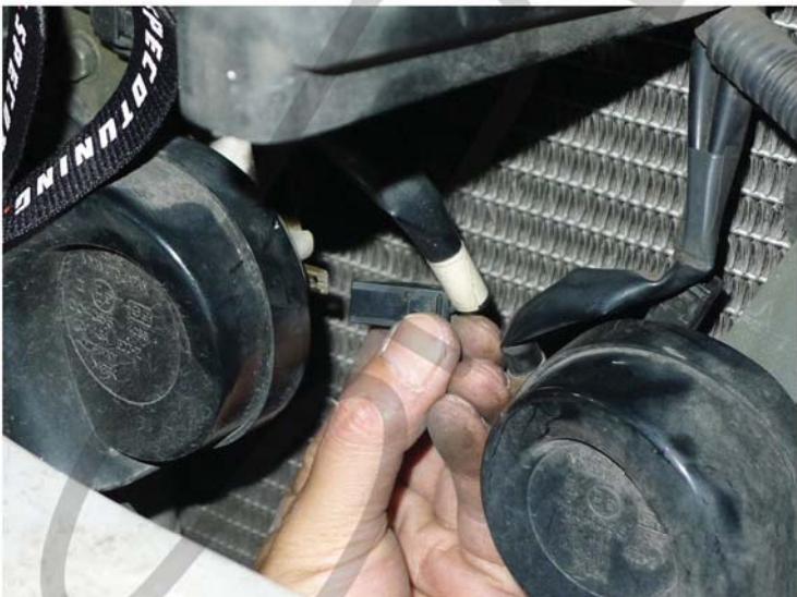
9. Disconnect the stock horns