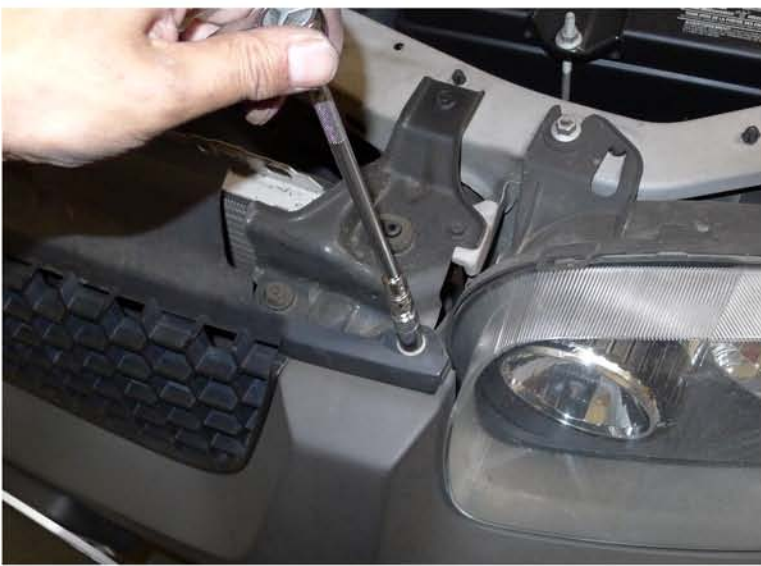
11. Remove the (2) 10mm bolts