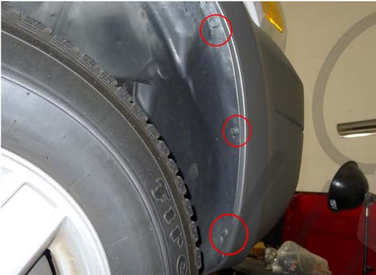
7. (3) plastic clips location