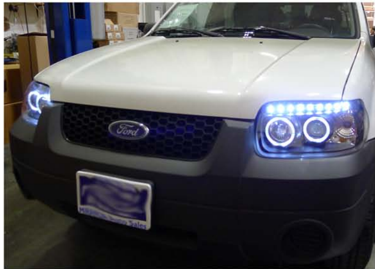
28. The installation is now complete