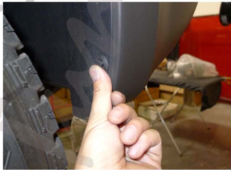
8. Remove the (3) 10mm bolts