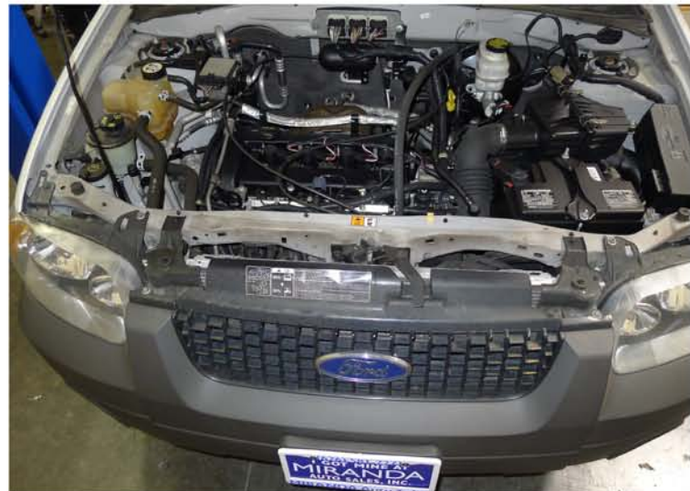
10. (2) 10mm bolts location