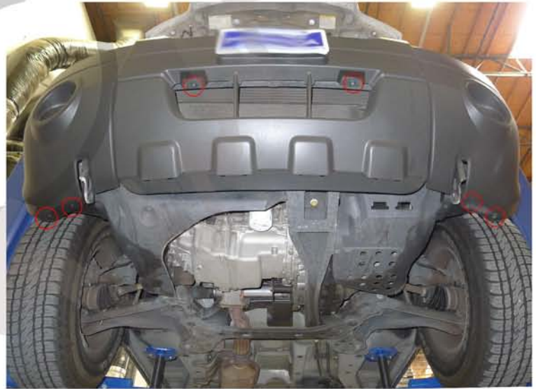
2. (2) plastic clips and (4) 10mm bolts location