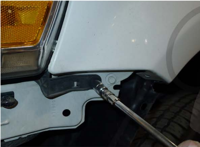
13. Remove the 10mm bolt