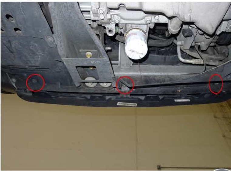
5. (3) 10mm bolts locaiton