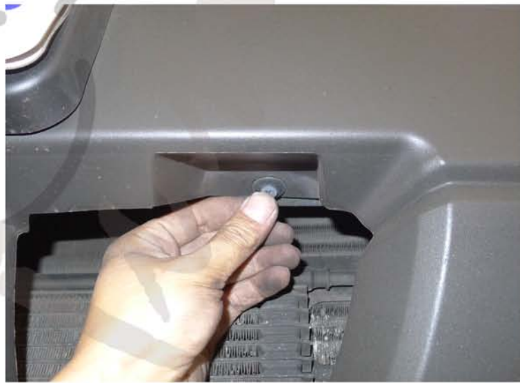
26. Replace the (2) plastic clips