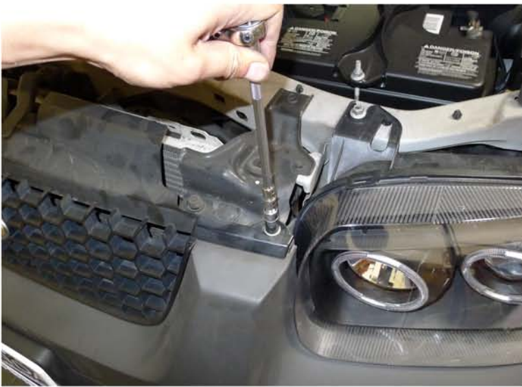
23. Tighten the (2) 10mm bolts