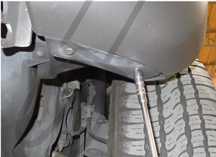
3. Remove the (4) 10mm bolts