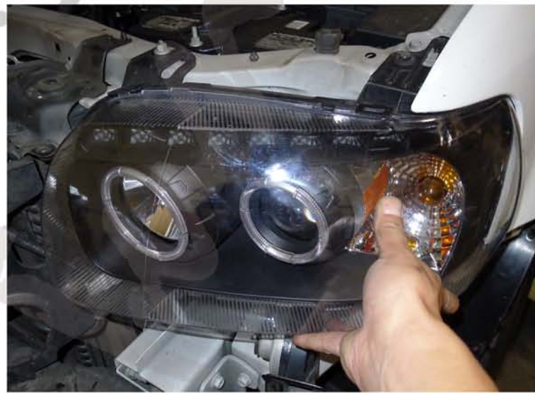
20. Place the new headlight in the stock location