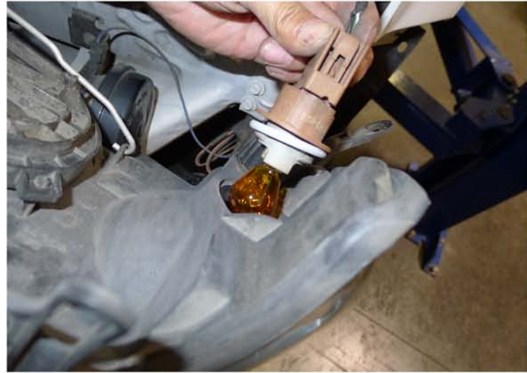
16. Remove the light socket