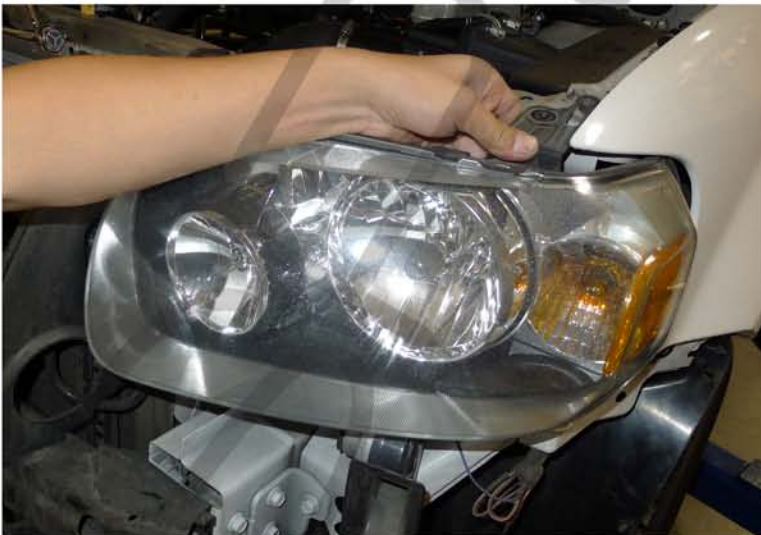
15. Remove the factory headlight