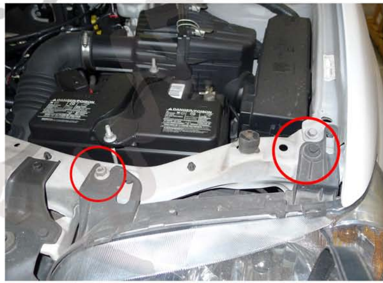
14. (2) 10mm bolts location