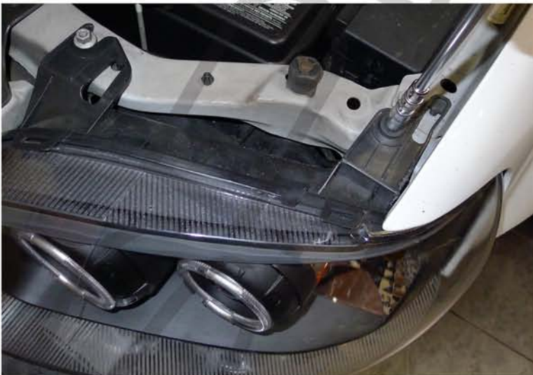
21. Tighten the (2) 10mm bolt