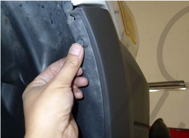
25. Replace the (3) plastic clips