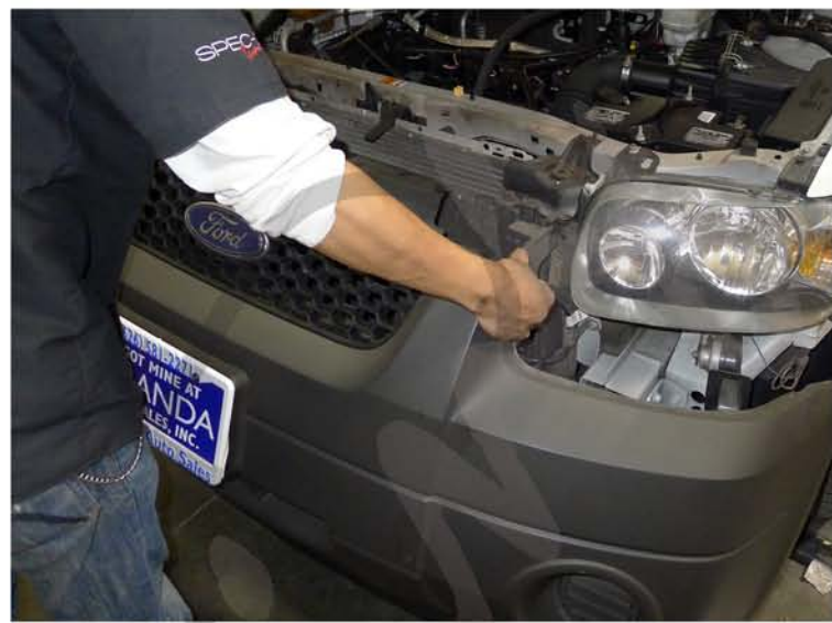
12. Remove the front bumper