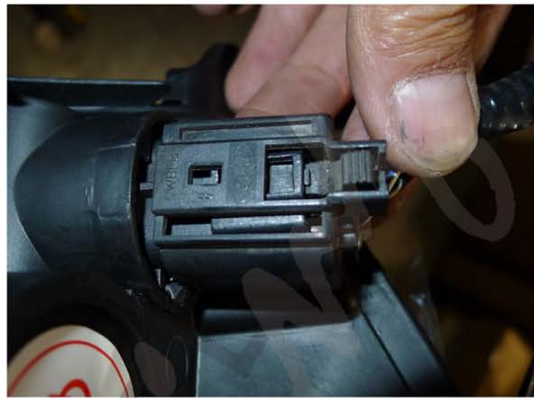
18. Connect the headlight harness to the new headlight

Please see the "L. E. D. and Halo headlights installation instructions" If your headlights don't have L.E.D. You can skip the installation instruction.