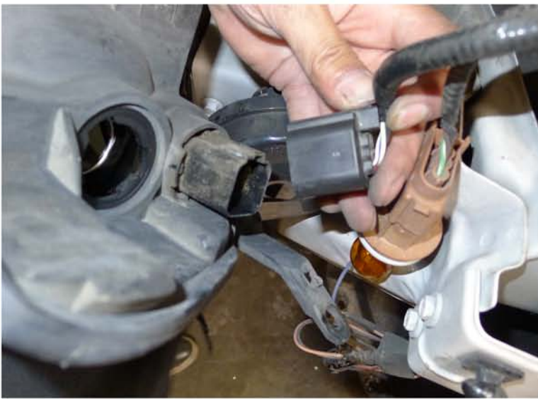
17. Disconnect the headlight harness