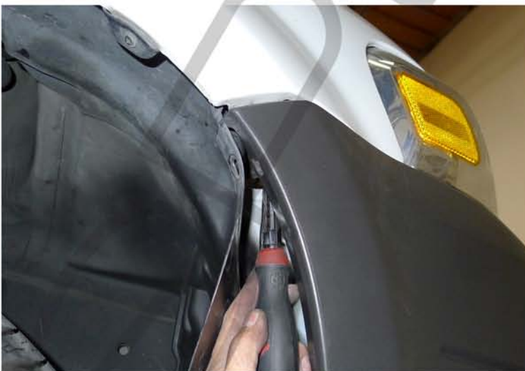
9. Remove the plastic clips