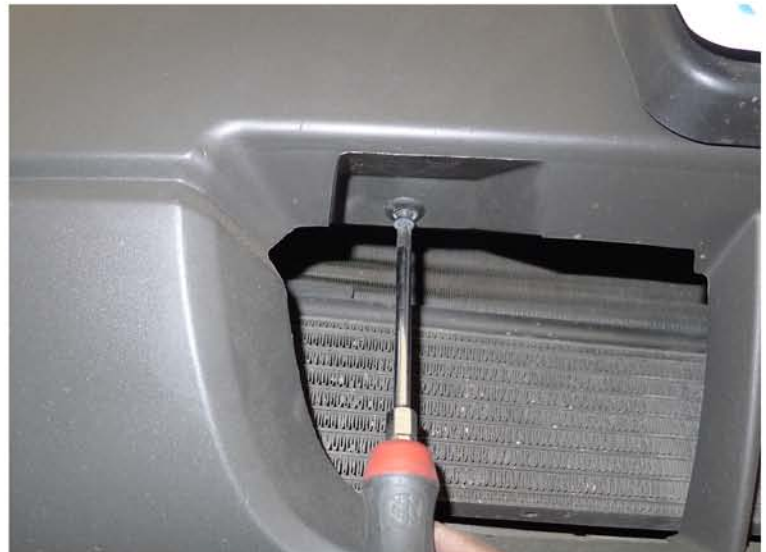
4. Remove the (2) plastic clips