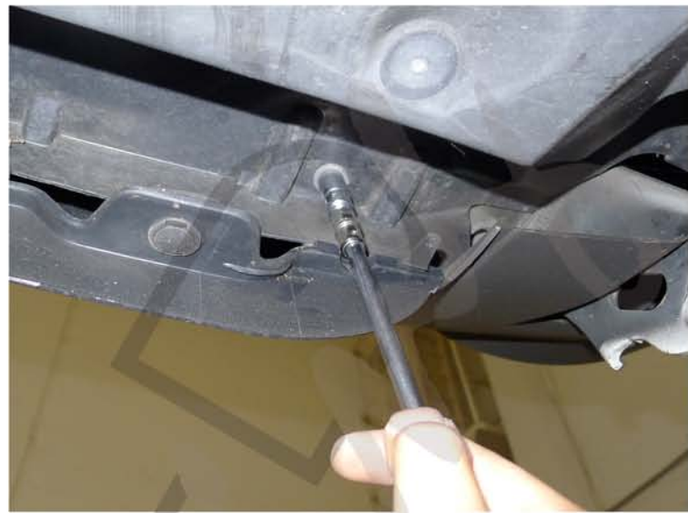
6. Remove the (3) 10mm bolts