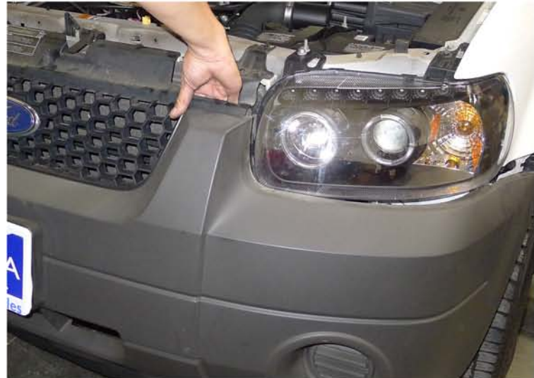
22. Replace the front bumper