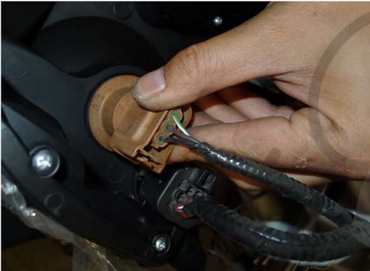
19. Install the light socket

Please see the "L. E. D. and Halo headlights installation instructions" If your headlights don't have L.E.D. You can skip the installation instruction.