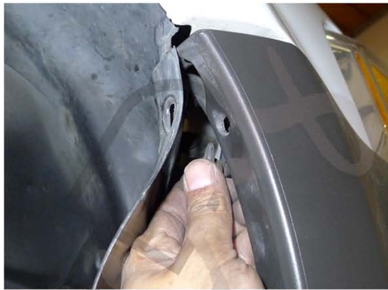
24. Install the plastic clip