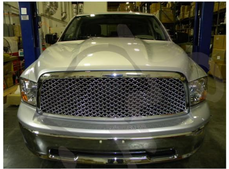
11. The installation is now complete