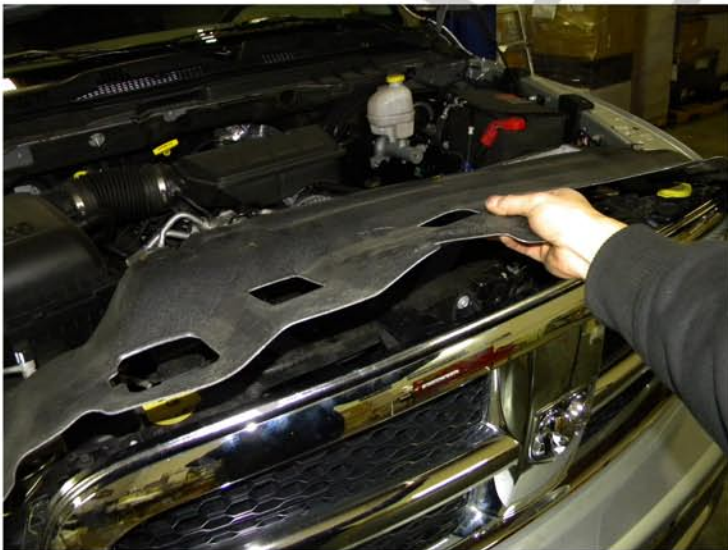
3. Remove Plastic Guard