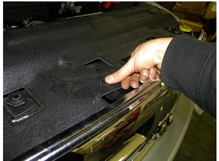
10. Replace the (6) plastic clips