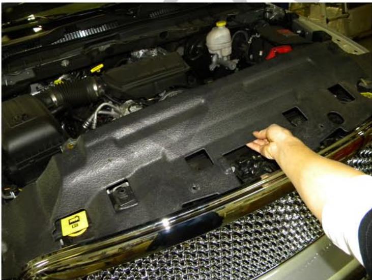
9. Replace the plastic guard