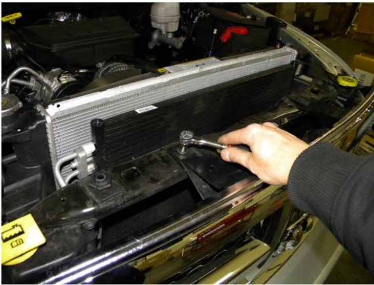
5. Remove the (4) 10mm bolts