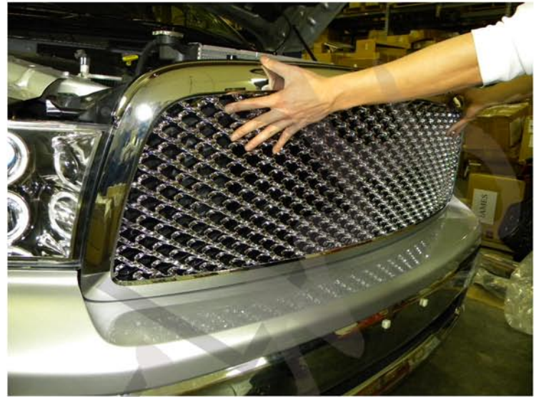
6. Place the new grill in the stock location