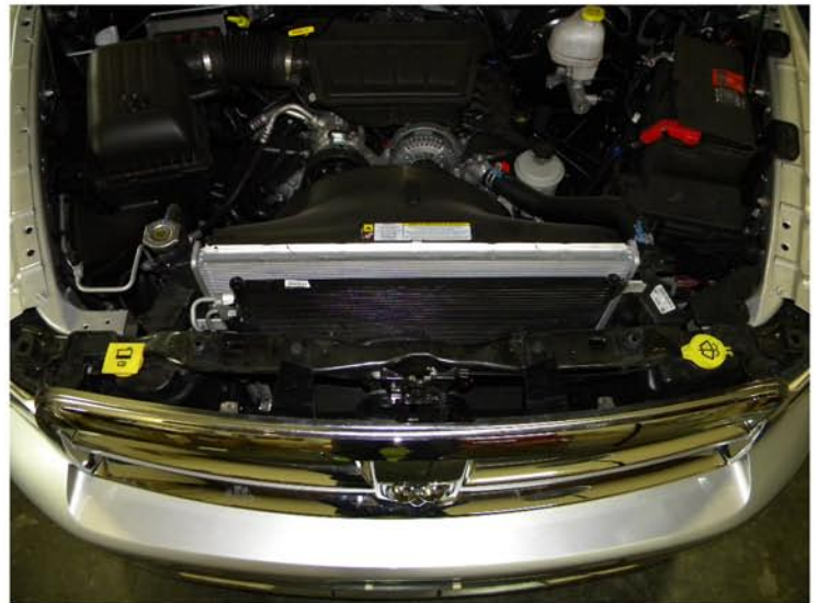
4. 4 10mm bolts location