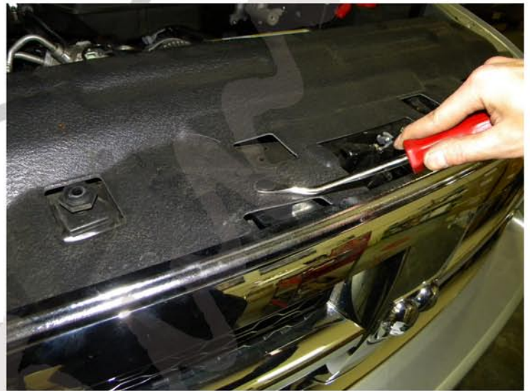
2. Remove 6 plastic clips