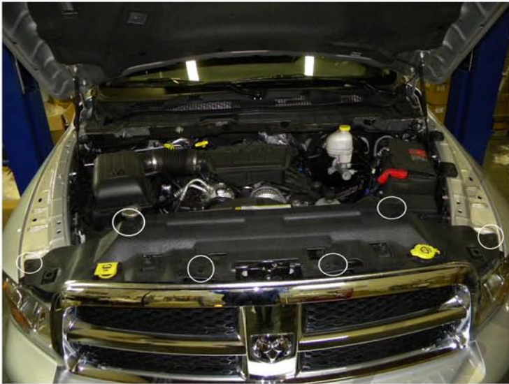
1. 6 plastic clips location

Do not make direct contact with the halogen bulbs or the wire assembly until the unit has cooled down after use.