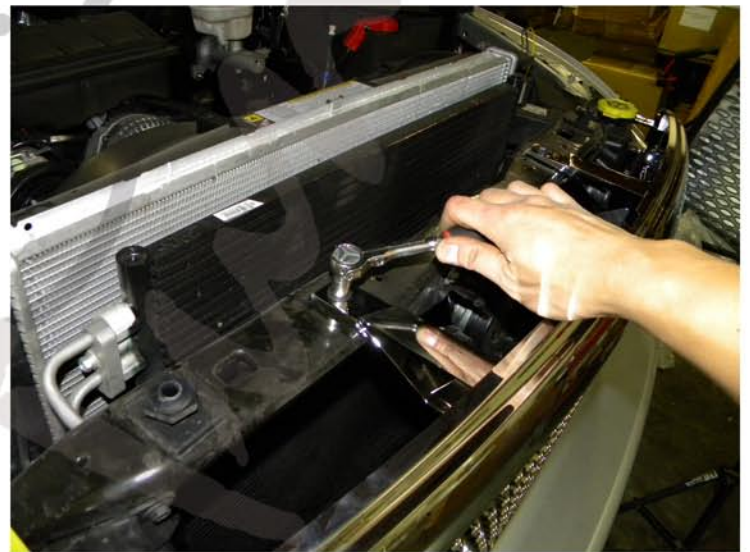
8. Tighten the (4) 10mm screws