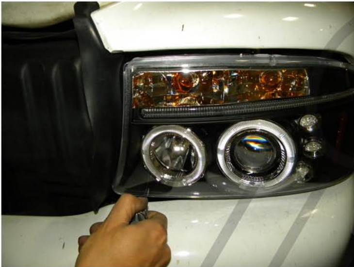
7. Put back the harness and three 10mm headlight bolts