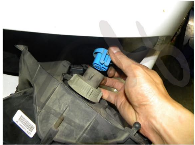
6. Disconnect the headlight harness and remove the headlight