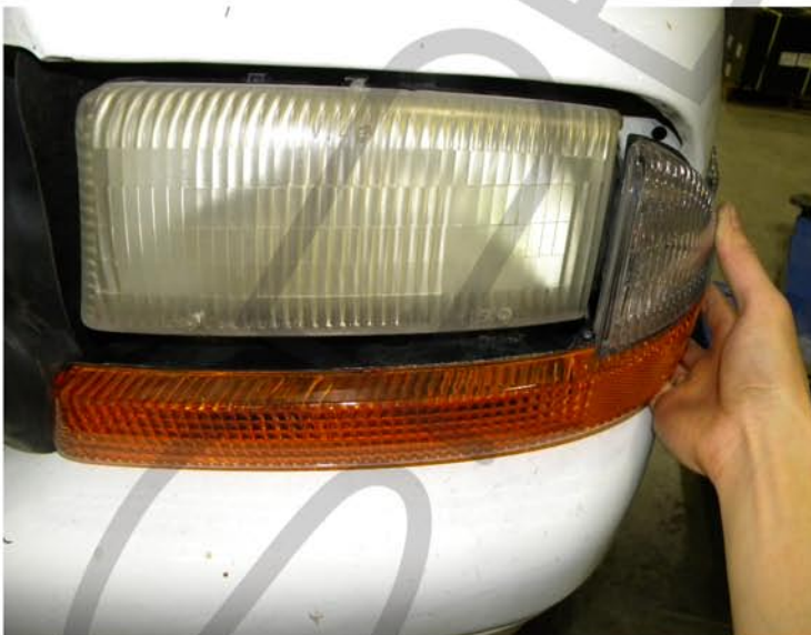
3. Remove one 10mm bolt