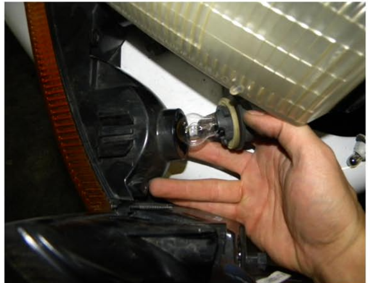
4. Unplug all socket from the bumper light and remove the bumper light