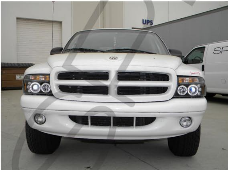
9. Please repeat the steps from 1 to 8 for the opposite side