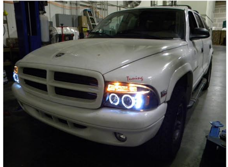
10. The installation is now complete