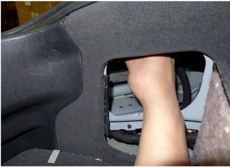
11. Tighten the (2) mounting screws