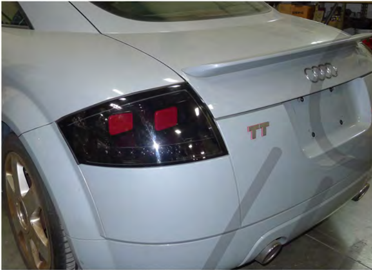
13. Please repeat the steps in order from 1 to 12 for the opposite side.