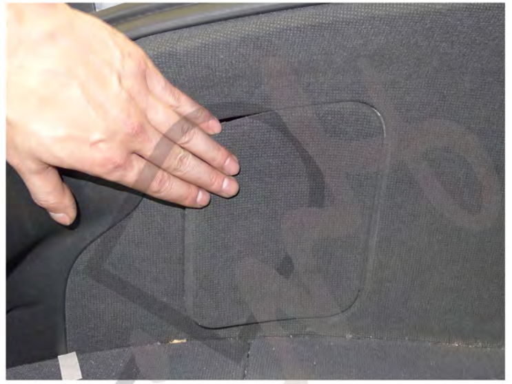
12. Close the flap