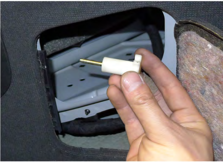
5. Remove the (2) mounting screws