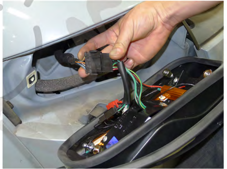
8. Connect the taillight harness to the new taillight

Please see the " L.E.D. tail lights installation instructions" If your tail lights don't have L.E.D. you can skip the installation instructions.