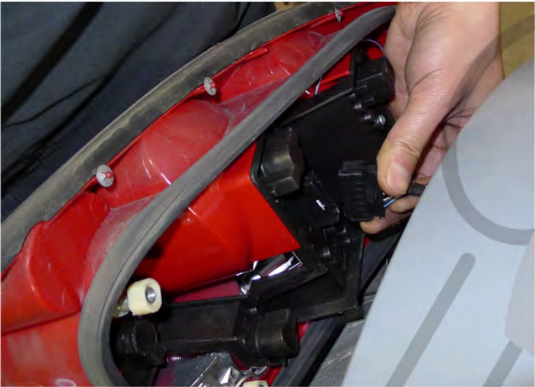
7. Disconnect the taillight harness