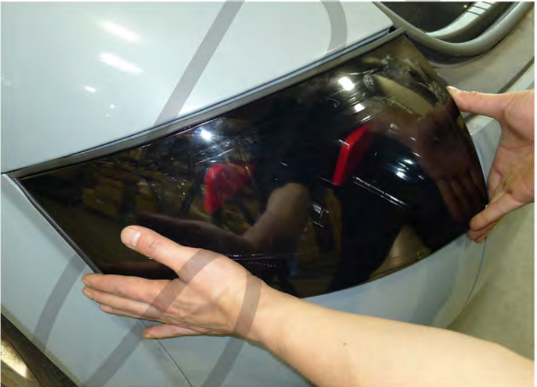
9. Place the new taillight in the stock location

Please see the " L.E.D. tail lights installation instructions" If your tail lights don't have L.E.D. you can skip the installation instructions.