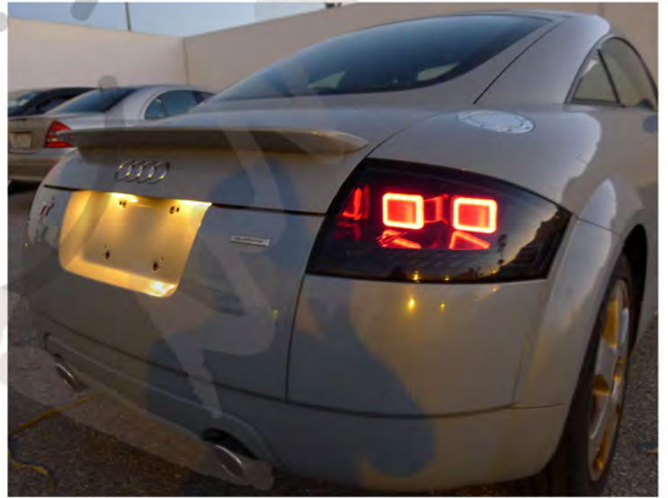
The installation is now complete.