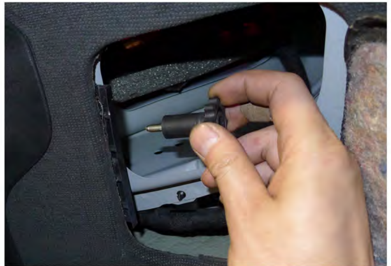
4. Remove the (2) mounting screws