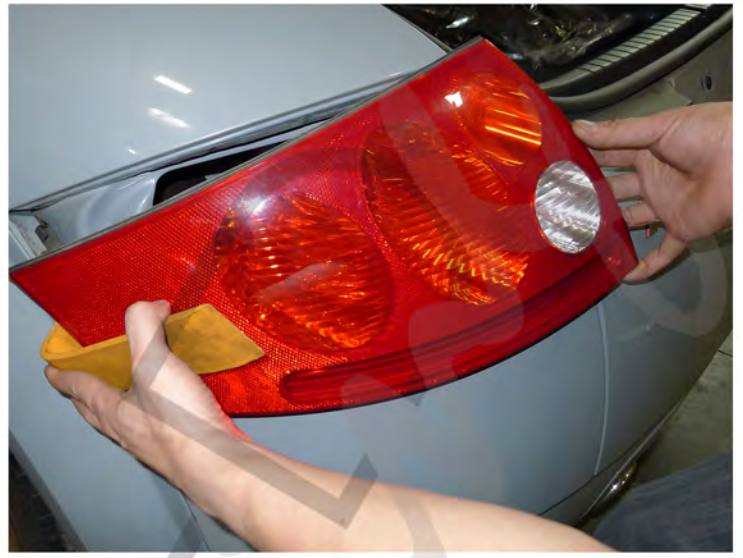
6. Remove the taillight