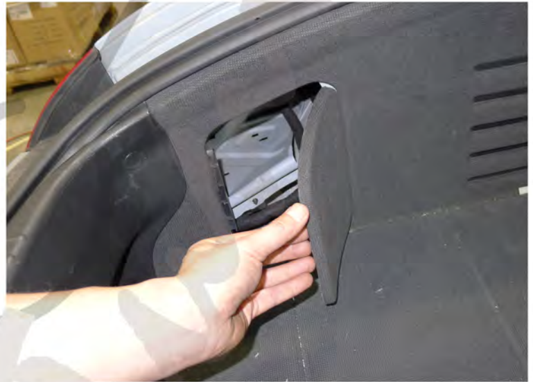
2. Open the access hole flap