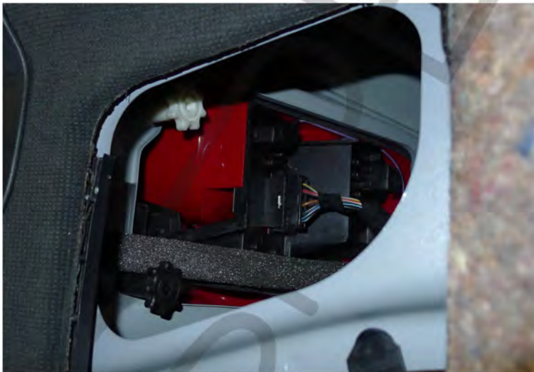
3. (2) mounting screws location